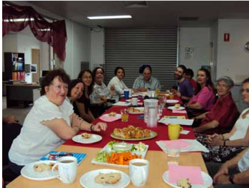
The Brisbane Local Area Network