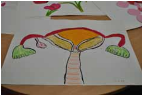
A plant or a woman?