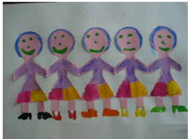
"Expressions of a woman"